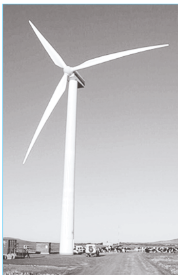
Alternative energy sources such as sun and wind can provide light for evening activities.

world each year as reported at the 15th session of the Commission on Sustainable Development (CSD 15) held in May 2007.