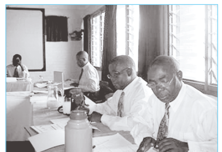
IWRM training for strategy formulation

This is to be supported by the development of a shared water information system for the basin, a rapid assessment report high-