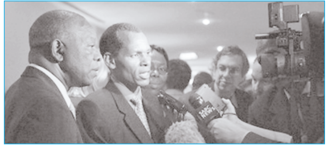
Francis D. Nhema (second from left), Minister of Environment and Tourism of Zimbabwe speaks to correspondents following his election as chairman of the 16th session of the Commission on Sustainable Development (CSD), at UN Headquarters in New York.

economies depend on the exploitation of natural resources.