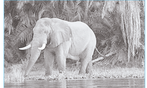
Elephants are part of the spectacular large mammal species that grace the Zambezi basin

Tanzania has greater carrying capacity but also has a high population of elephants, which has increased from 55,000 in 1989 to 141,000 in 2006.