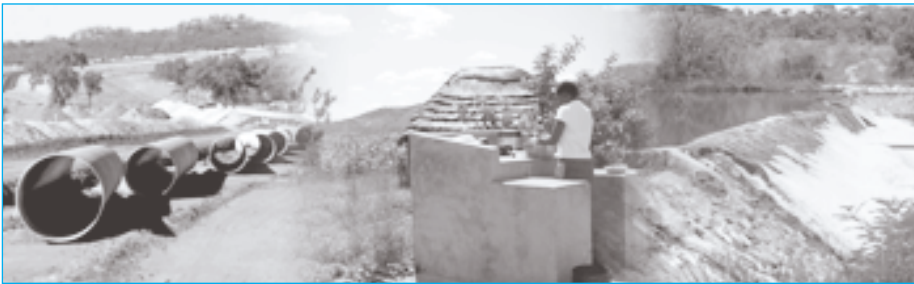
16 th session of UN CSD to focus on rural development.

The Commission on Sustainable Development was established by the UN General Assembly in December 1992 to ensure effective follow-up of commitments contained in Agenda 21, a programme of action on sustainable development adopted in June of that year at the UN Conference on Environment and Development. r